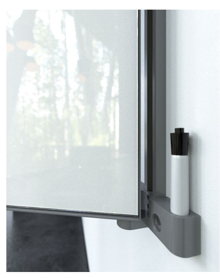
The patented design of Flip features self-leveling hardware and magnets. That means your board will fit snug to your wall, even if it is hung on an uneven surface.