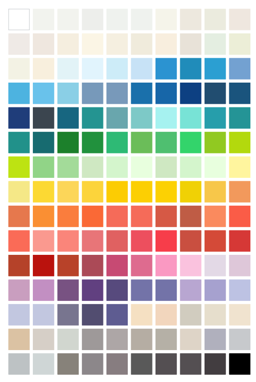
Standard CBC Library

Customize your glass with any color. Visit clarus.com/CBC to see the entire Colors by Clarus collection.