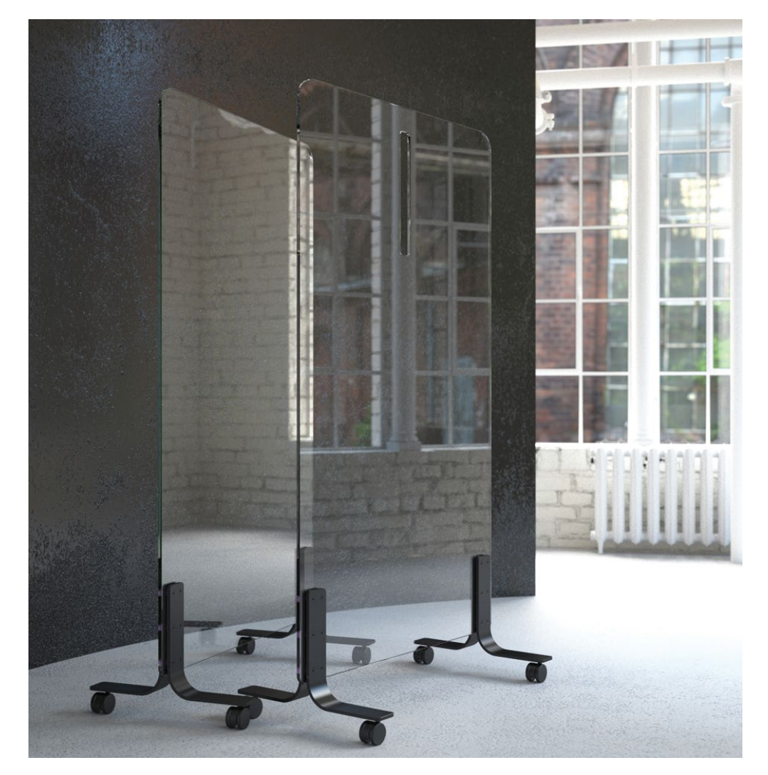
Legs: Black | Without & with thermometer cutout

be! Clear is an innovative, non-porous mobile glassboard that serves many purposes. Whether you use it as a protective shield from today's various health threats, as a collaborative writing surface, or as a temporary space divider that threats, as a collaborative writing surface, or as a temporary space divider that won't impact the integrity of your open-concept office design, you can keep everyone healthy and at a safe distance without impeding the sightline from one end of your space to the other. The optional cutout feature allows you to safely take the temperature of incoming employees, customers or visitors, as well as handoff important documents through an easily sanitized barrier while safeguarding everyone. Thanks to the natural properties of glass, be! Clear is safety and mobility rolled into one perfect solution.